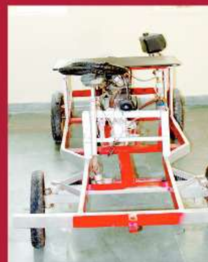
HYDROGEN FUEL CELL CAR

CGC Jhanjeri is dedicated to advancing research by providing comprehensive financial support with an annual budget of 15Cr. The institutions fully funds all research-related expenses, including presentations and publications, leading to the impressive achievement of more than 1300 published research papers in SCI/SCIE/ESCI/SCOPUS/ABDC/WOS/UGC Care indexed journals. Furthermore, our student-friendly patent policy facilitates the development and filing of patents, with the college covering all associated costs. Over the past few years, we have submitted more than 2000 patent applications, leading to 437 published patents that benefit inventors, students, and faculty alike.