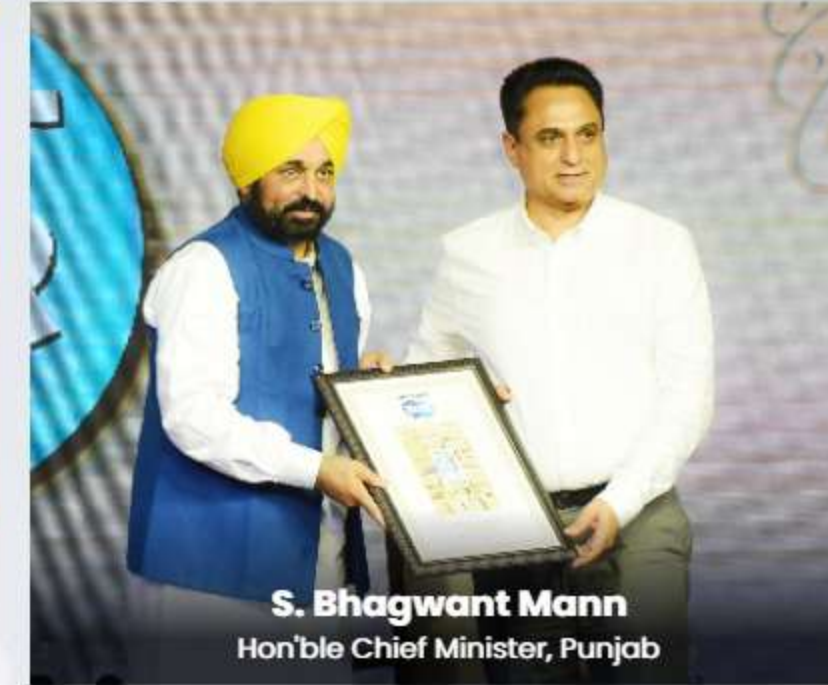
S. Bhagwant Mann Hon'ble Chief Minister, Punjab