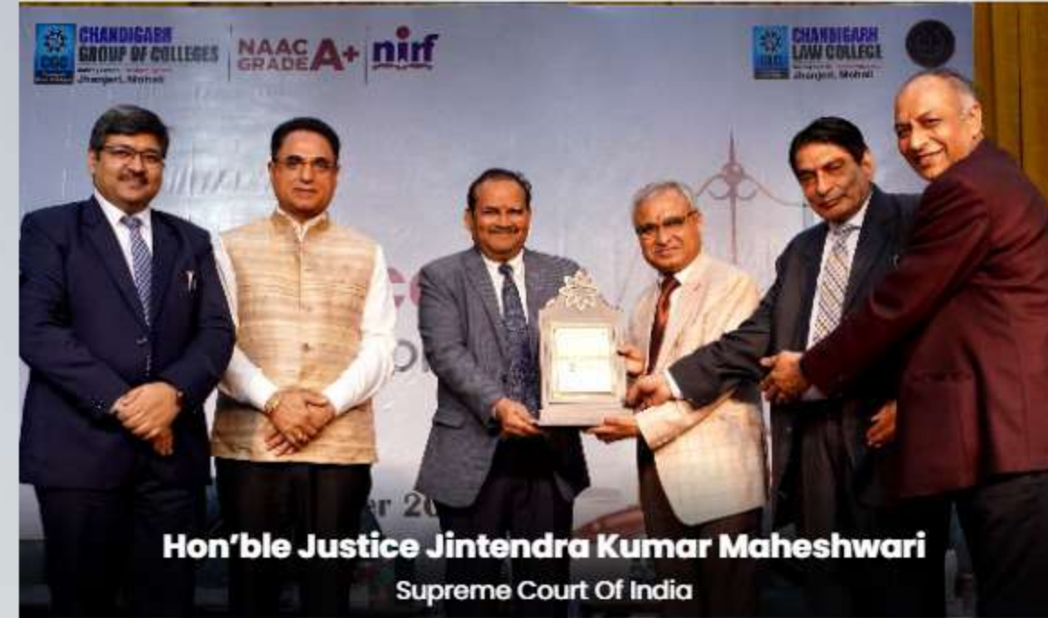
Hon'ble Justice Jintendra Kumar Maheshwari Supreme Court Of India