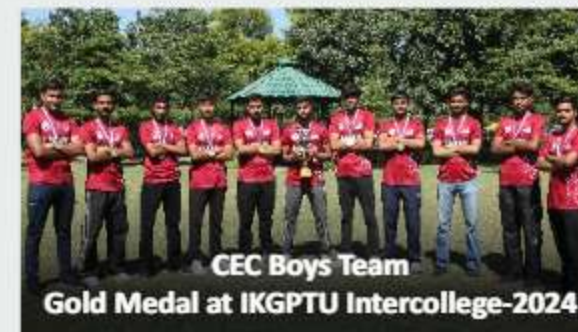
CEC Boys Team Gold Medal at IKGPTU Intercollege-2024