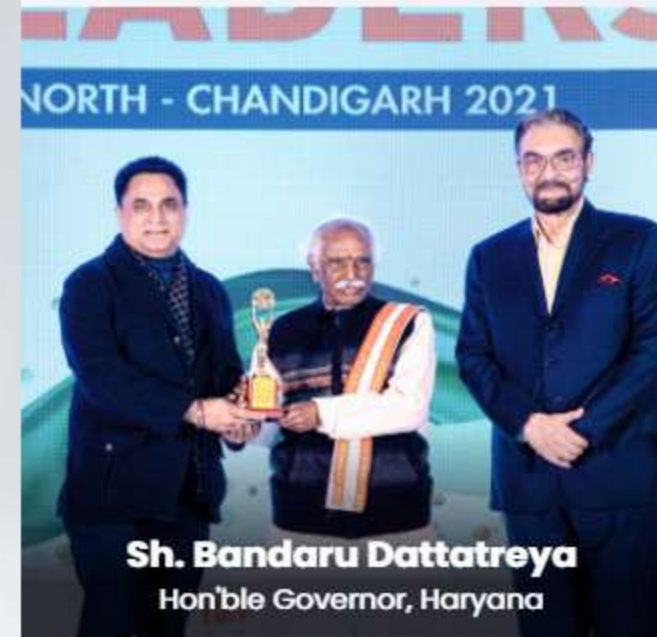
Sh. Bandaru Dattatreya Hon'ble Governor, Haryana