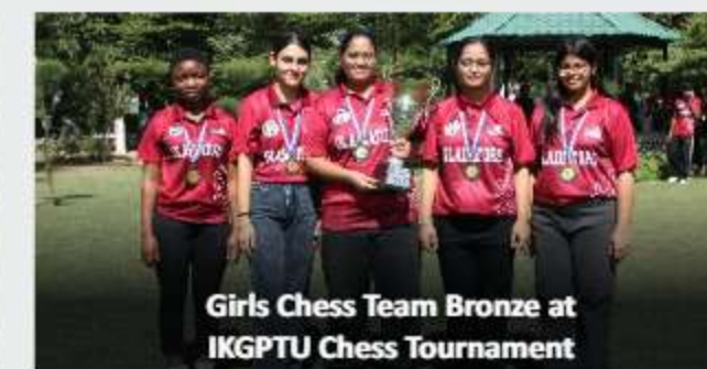
Girls Chess Team Bronze at IKGPTU Chess Tournament