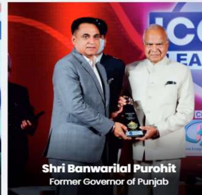
Shri Banwarilal Purohit Former Governor of Punjab