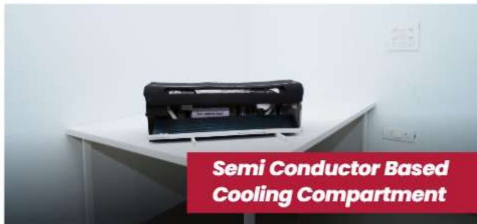
Semi Conductor Based Cooling Compartment