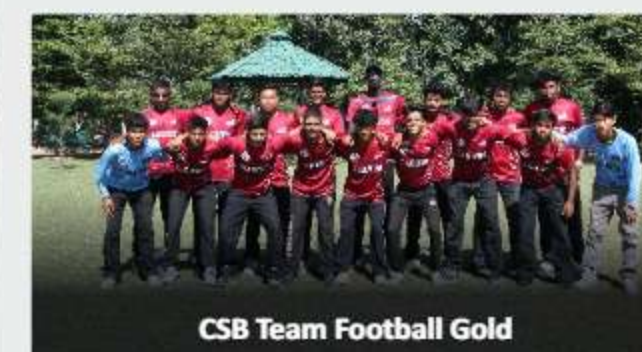
CSB Team Football Gold