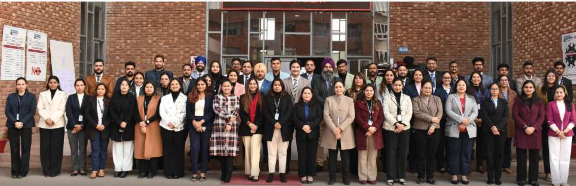
A TEAM THAT TURNS AMBITIONS INTO ACHIEVEMENTS

At CGC Jhanjeri, the Division of Career Planning and Development (DCPD) plays a pivotal role in shaping the future of our students. Committed to fostering holistic career growth, the DCPD offers a comprehensive range of services designed to equip students with the skills and knowledge they need to thrive in today's competitive job market.