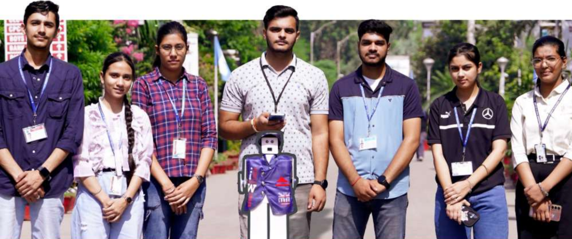
VASUKI THE ROBOT

VentureNest: Empowering Startups for a Brighter Tomorrow VentureNest, the Technology Business Incubator Association of Chandigarh Group of Colleges, Jhanjeri, is a thriving hub for innovation and entrepreneurship, recognized by Startup Punjab and the Punjab State Council for Science & Technology (PSCST). We are at the forefront of fostering startup growth across various sectors, including AI/ML, DeepTech, AgriTech, EdTech, and FinTech. Our incubator has successfully nurtured numerous startups, providing co-working spaces, mentorship, funding opportunities, and access to legal and financial advisory services. We proudly collaborate with ecosystem enablers like Innovation Mission Punjab, Chandigarh Angels Network, and Punjab Angels Network to ensure that startups receive the resources necessary to scale and succeed. With a mission to drive innovation and sustainable business growth, VentureNest is dedicated to creating a dynamic entrepreneurial ecosystem.