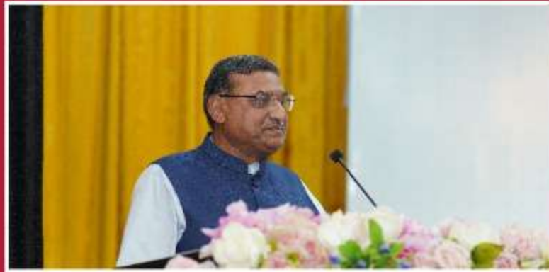
SHRI RAJDEEPAK RASTOGI (SR. ADVOCATE AND ADDITIONAL SOLICITOR GENERAL OF INDIA)