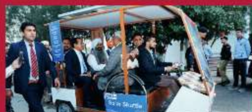
SOLAR GRASS CUTTER