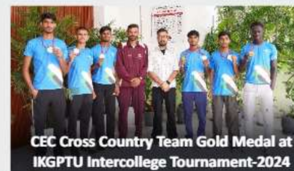
CEC Cross Country Team Gold Medal at IKGPTU Intercollege Tournament-2024