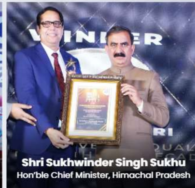
Shri Sukhwinder Singh Sukhu Hon'ble Chief Minister, Himachal Pradesh