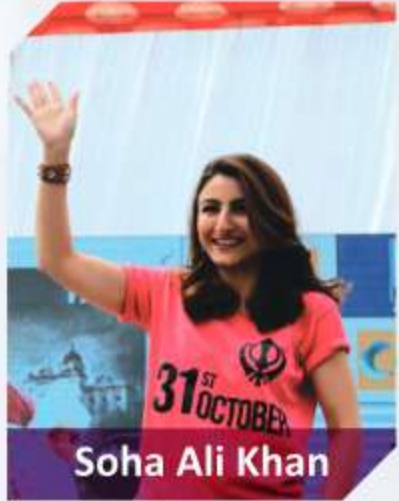
Soha Ali Khan