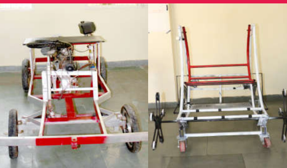
Hydrogen Fuel Cell Car