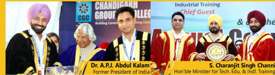
Dr. A.P.J. Abdul Kalam Former President of India

2nd Prize in Fray, 3rd Prize in Line Follower & 3rd Position in Junkyard Wars during Exodia held at IIT, Mandi, April 2016.