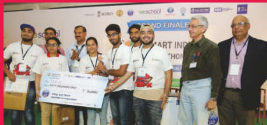
The team "TER-X" of CGC Jhanjeri won Second Runners up position with cash prize of Rs. 50000/- in Smart India Hackathon-2017.

Some Laudible Achievements of CGC JHANJERI students include: