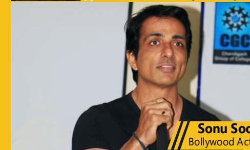
Sonu Sood Bollywood Actor