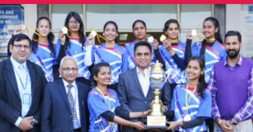
CGC jhanjeri GIRLS win Trophy & Gold Medals at IKG PTU's Inter College Volleyball Tournament 2018