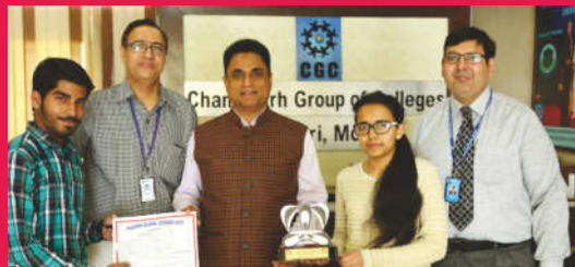
Students of CGC Jhanjeri bagged 2nd Position along with Cash Prize at INNOTECH 2017 held at Pushpa Gujral Science City in collaboration with PTU.