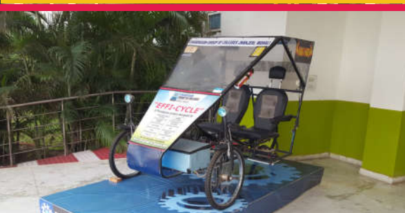
Efficycle, a prestigious project in competition organised by SAE and Maruti Suzuki