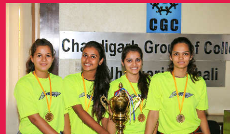
CGC jhanjeri Girls win TROPHY & Gold Medals in IKG PTU's Inter College Badminton Championship 2017

1st Prize for the Extempore Project "Traffic Light Operations Based on Vehicle Density" at IIT, Roorkee, 2015.