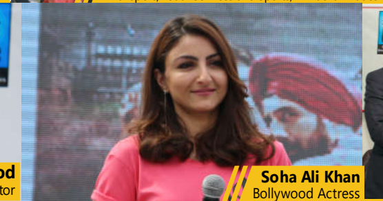
Soha Ali Khan Bollywood Actress