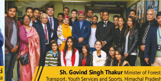
Sh. Govind Singh Thakur Minister of Forest, Transport, Youth Services and Sports, Himachal Pradesh