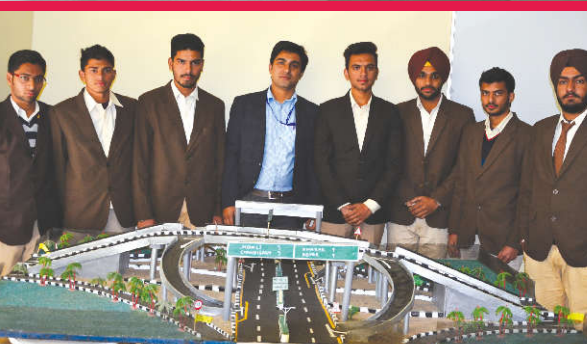
Flyover for Landran Crossing designed by Civil Engg. Students