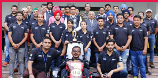
Mechanical Engg. Students bring Laurels to Cgc Jhanjeri by winning 1st Runner-up Trophy in All India GO KART™ Design Challenge held at Coimbatore, Tamil Nadu 2018