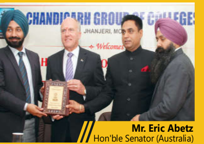
Mr. Eric Abetz Hon'ble Senator (Australia)