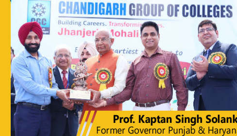
Prof. Kaptan Singh Solanki Former Governor Punjab & Haryana